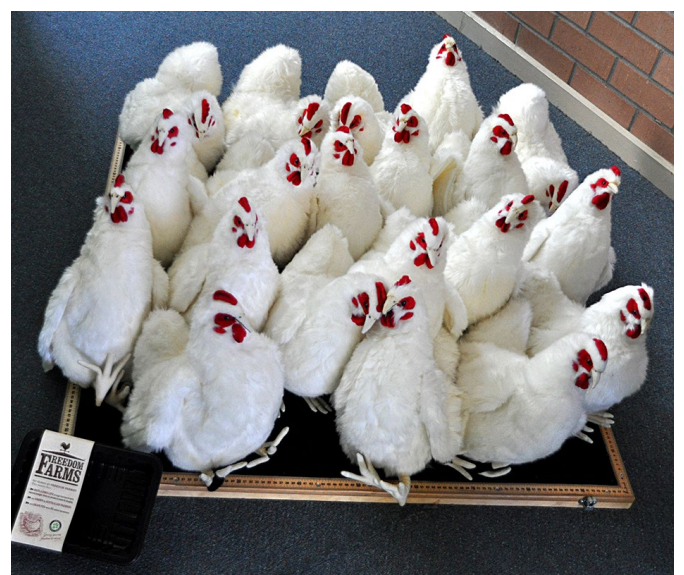
RSPCA information on sustainable and humane chicken farming