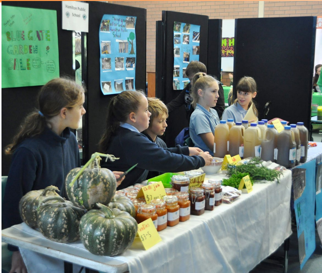
Hamilton Public School garden produce stall