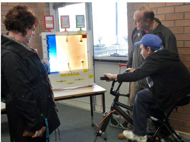
Demonstrating cycle power