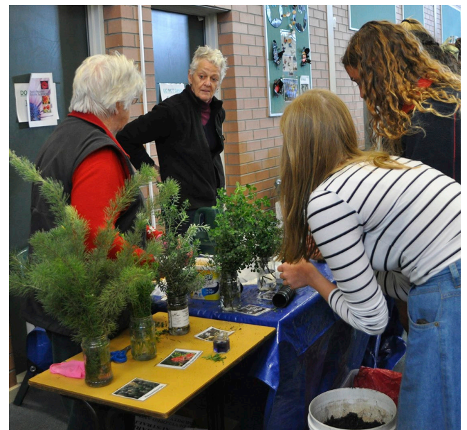
Learning about native plants from Hunter Region Botanic Gardens