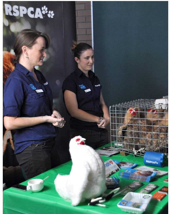
RSPCA representatives present information on sustainable and humane chicken farming

SD Environmental Management – solutions for businesses