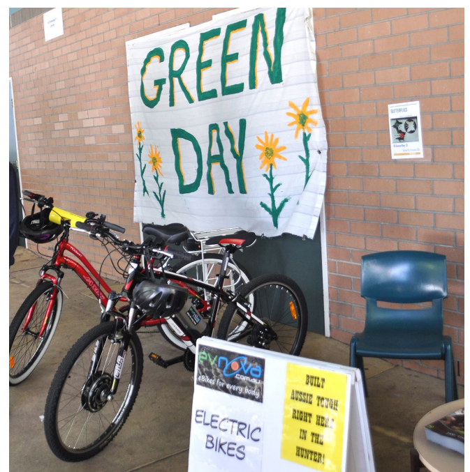
Right: Electric bike demonstration by Hunter TAFE

The Green Day initiative saw sustainability education at Merewether High embedded in whole school practice through a range of fun and interesting activities during different time periods on a single day of the year. The activities are aimed at increasing student conceptual knowledge about sustainability, increasing awareness of how local organisations promote and enhance sustainability in their community and providing ideas for students to take action on sustainability issues.