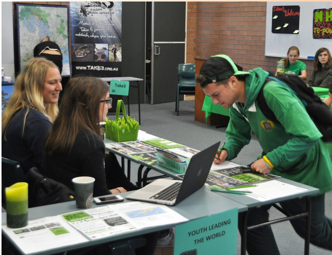
Signing up to participate in action for sustainability.