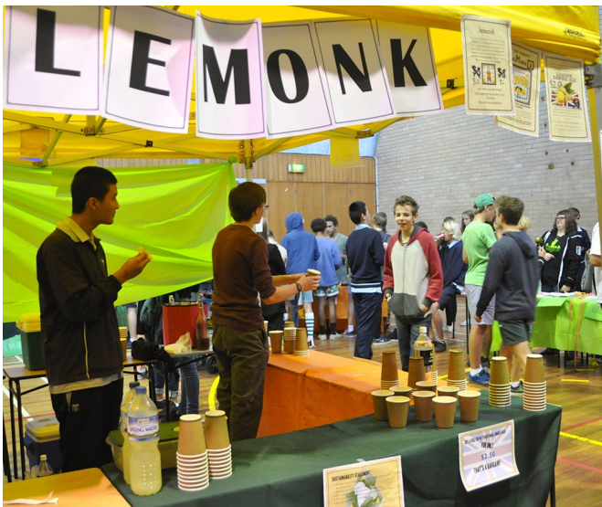
Business sustainability statement (right) for the Lemonk enterprise stand