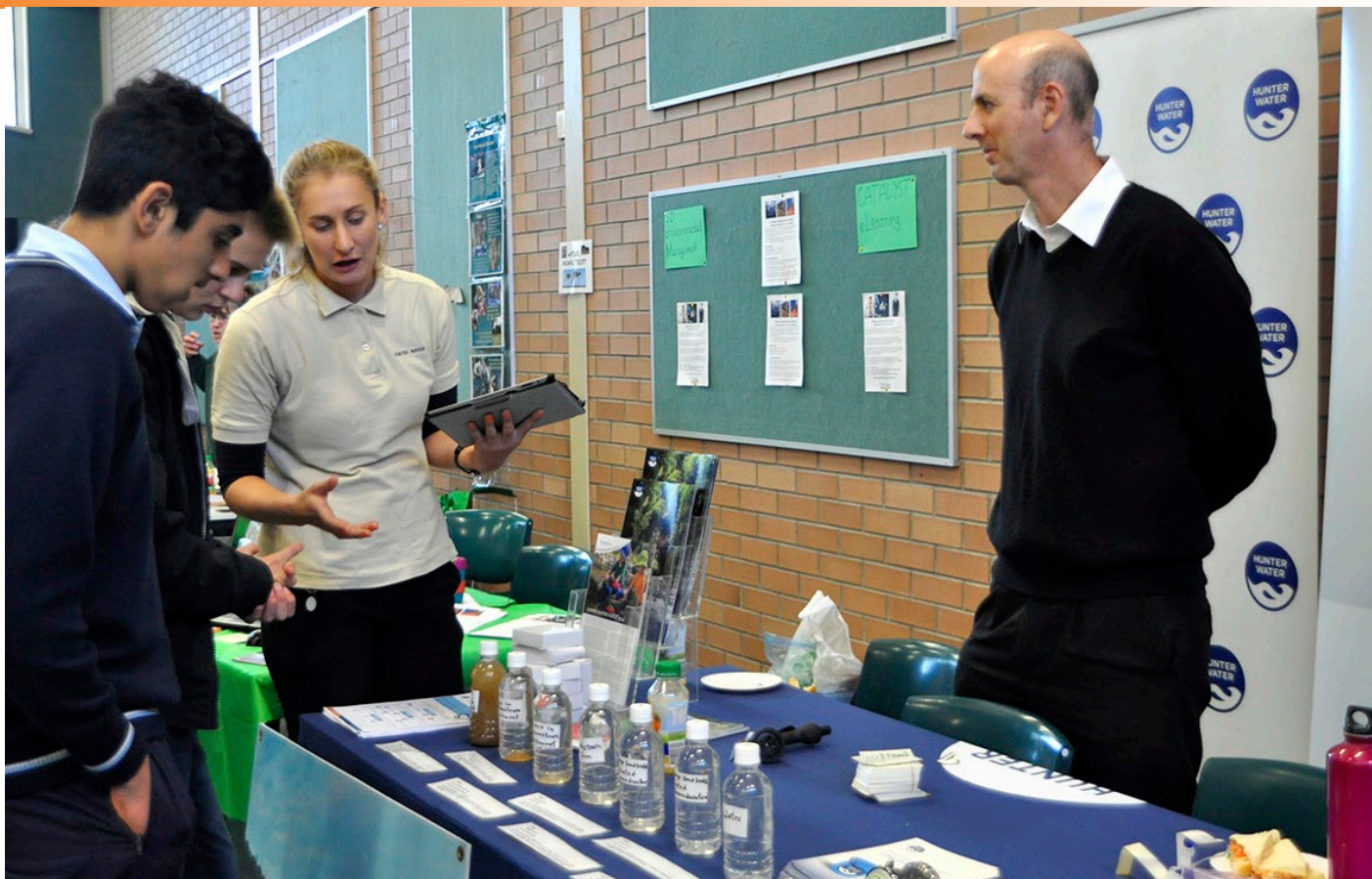
Learning about Hunter Water

While environmental sustainability forms the focus of Merewether High School's Green Day, students are also presented with thought provoking issues related to environmental, economic and social sustainability such as such as animal cruelty in farming, volunteering, environmental responsibility and social justice.