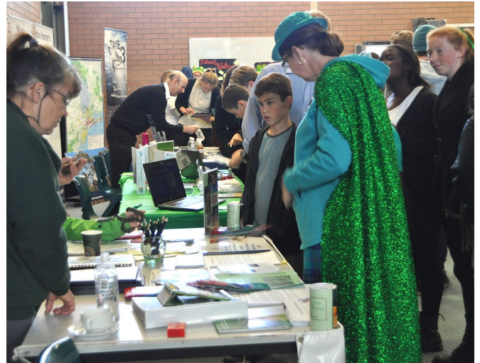
Students engage with community organisations such as wildlife rescue