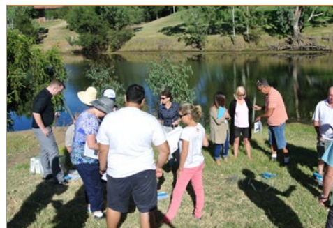
Teachers undertaking fieldwork activities on the Macquarie River, Dubbo