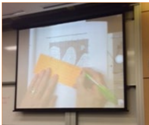
HSC students at Wollongong University lectures practice important skills