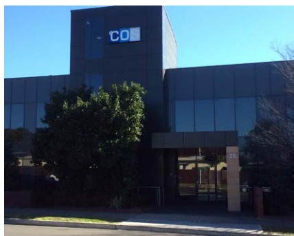
COS Building, 25 Nyrang St Lidcombe.

Please note the new GTANSW Office address for mailed and delivered fieldwork entries.