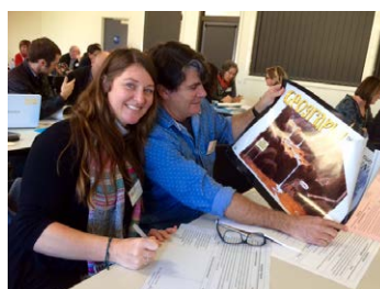
Teachers using cartoons and visual resources to program at the Coffs Harbour GTANSW regional conference