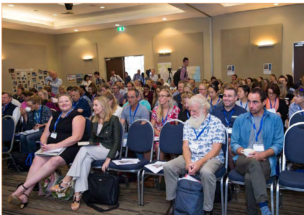
Ready for a big day at the GTANSW 2017 Annual Conference