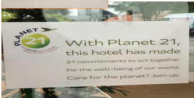
Signs promoting sustainability at Novotel, Sydney Olympic Park.