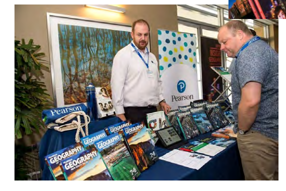
The resources available to support the teaching of Geography today are a long way from the textbooks of old