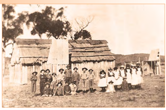
Students outside the Severn River Provisional School, 1897

Because of the Great Economic Depression in the 1920's, it was not until the 1930's that qualified Geographers entered the