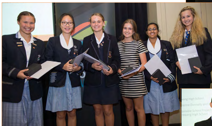
A selection of Arthur Phillip Award winners