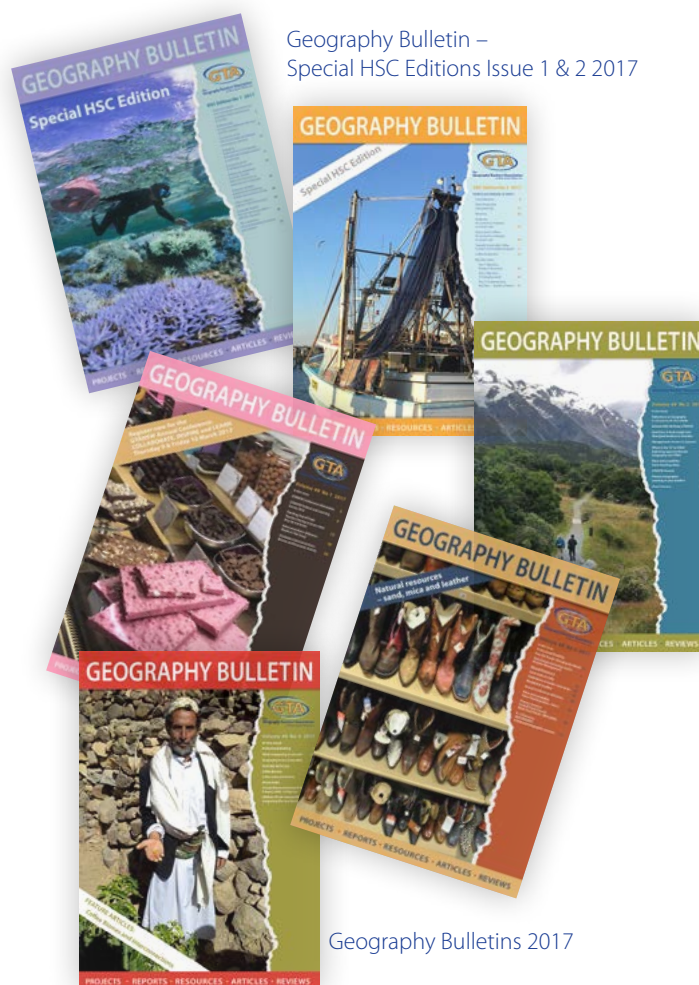
Geography Bulletin – Special HSC Editions Issue 1 & 2 2017

2018 will see a new more attractive and user friendly website – www.gtansw.org.au