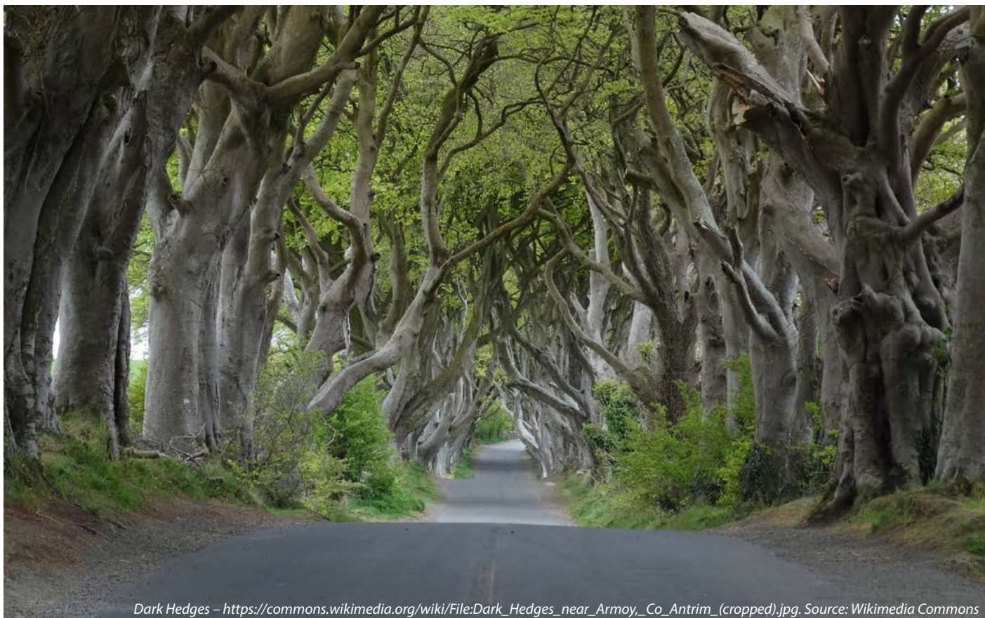
Dark Hedges