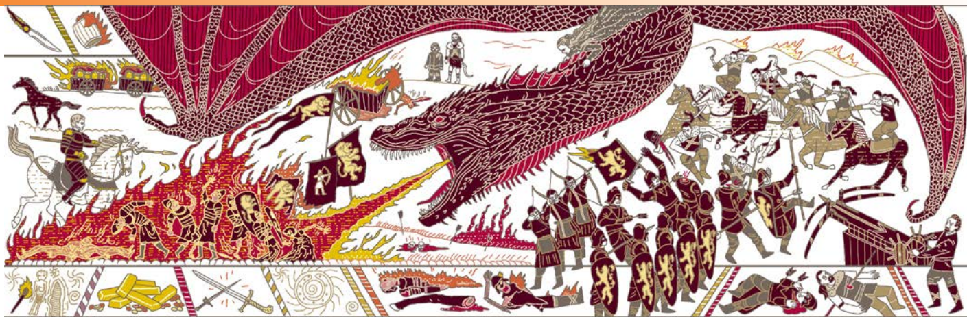
Battle of the Goldroad from Game of Thrones - Season 7 Episode 4. Artwork for the official Game of Thrones tapestry produced in Northern Ireland.