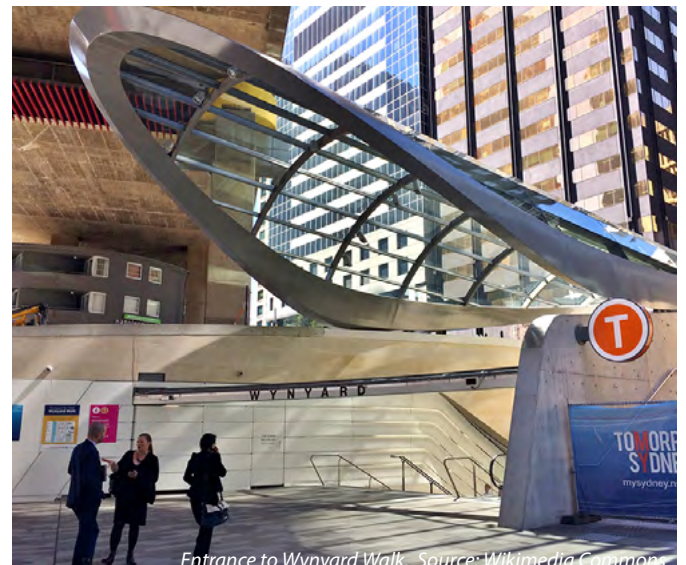
Entrance to Wynyard Walk.

Barangaroo is a 22 ha inner-city suburb of Sydney, New South Wales, Australia. It is located on the NW edge of the Sydney central business district and the southern end of the Sydney Harbour Bridge; Post code 2000. The new suburb of Barangaroo has undergone a transformation from its historical past. In many ways, Barangaroo is a snap shot reflection of Sydney; the industrial and trade era to the new clean energy and financial hub of the city. What we see today is the culmination of years of planning for a better Sydney foreshore and a reflection of the changing nature of Sydney as a world city. Barangaroo is the result of two key urban dynamics: urban decay followed by urban renewal. It is difficult to discuss this urban renewal project without a context of urban decay.