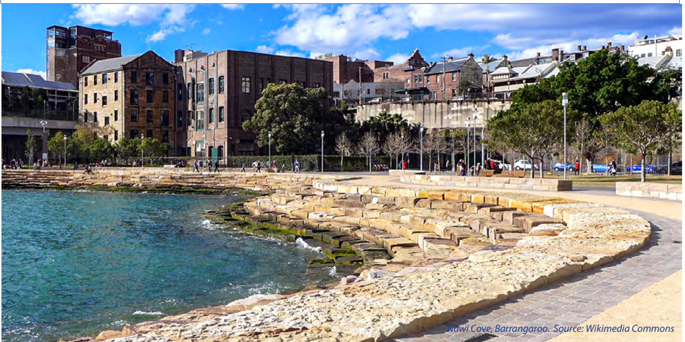
Nawi Cove, Barrangaroo.

(2010) Analyse ONE of the urban dynamics of change operating in a country town or a suburb