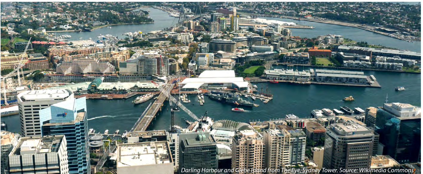
Darling Harbour and Glebe Island from The Eye, Sydney Tower.

Classroom discussions involve identifying and exploring geographical methods applicable and useful in the workplace and how to apply the information to short answer HSC questions.