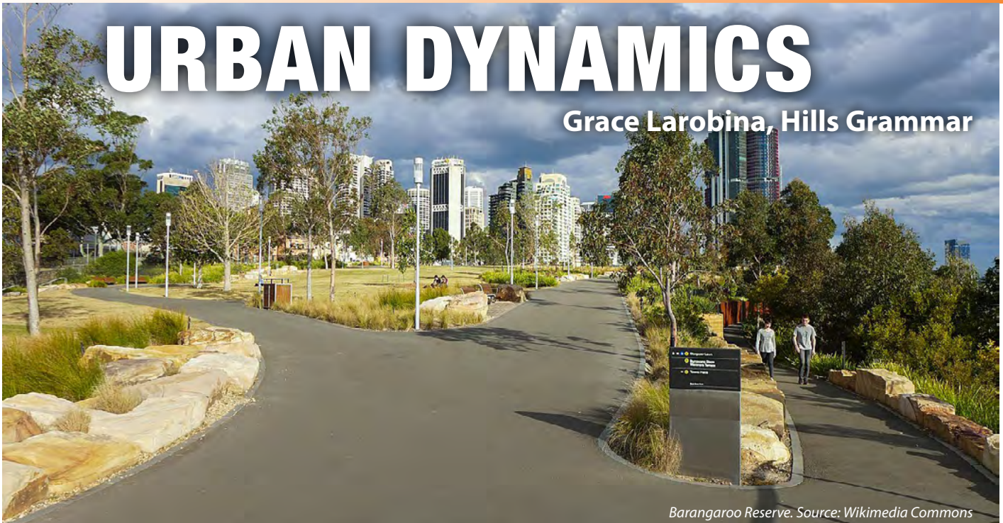
Barangaroo Reserve.