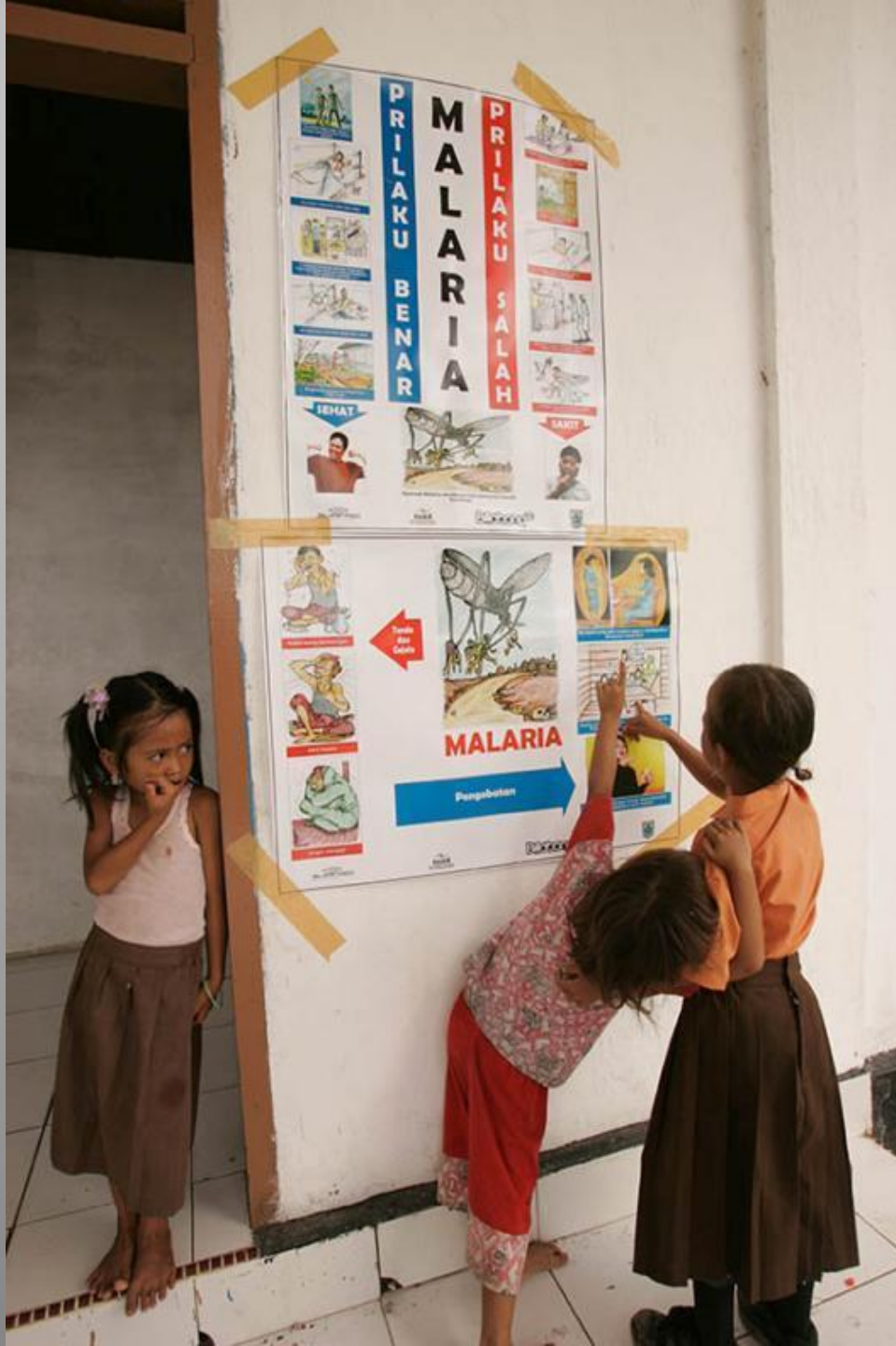
Learning about the causes of Malaria