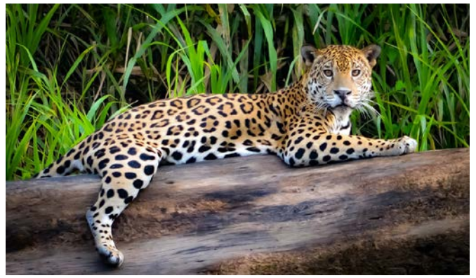
Figure 5: Amazon jaguar

The Amazon also pumps vast quantities of moisture into the air through a process called transpiration. About half of this moisture falls as rain within the basin. The rest travels large distances to other parts of South America via 'atmospheric rivers' and contribute to the precipitation in these areas. As the forest is lost or fragmented this transfer of moisture is disrupted. Potentially, this could disrupt rainfall patterns across the continent.