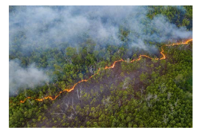
Figure 8: Burning rainforest, Indonesian Borneo

In the absence of human intervention, forests fires in Borneo were very rare events. Peat, which is made up of partially decaying plant material, acts like a giant sponge, soaking up excess water during the monsoon and staying damp to prevent fires during the dry season.