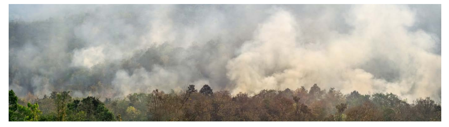
Figure 2: Drone-based image of an Amazon blaze