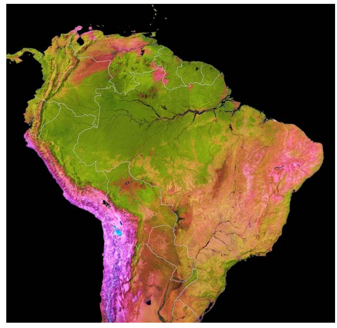
Figure 6: False colour image of South America