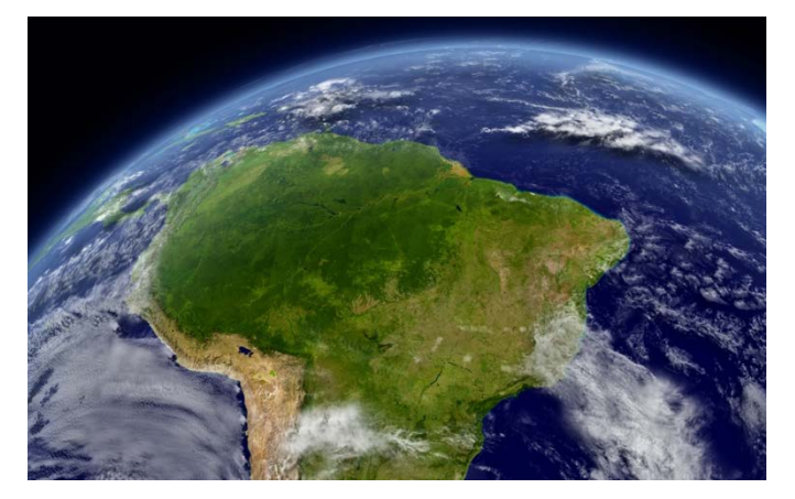
Figure 4: South America as seen from space. The vast swathe of the Amazon Basin still dominates the landcover of the northern two-thirds of the continent.

Despite its vast size, and its importance to the planet, there is still much to learn about the complexity of its contribution to earth's ecosystem services. Given that it is largely surrounded by mountainous plateaus, much of the basin is remote and difficult to access.