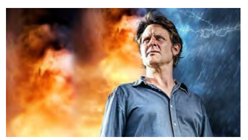
ABC Education Big Weather resources

Below is a collection of resources that support both teachers and students learn more about disaster resilience and preparedness.