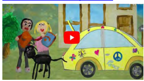
Survive and Thrive in a Bushfire