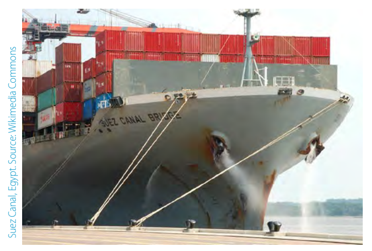
The total volume of cargo being transported through the canal has increased steadily in recent years. This includes consumer goods, dry-bulk cargo such as grain and minerals, and oil products.