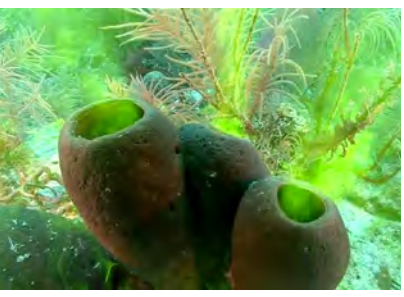
ABOVE: Sponge Garden. Ocean Imaging. Great Southern Reef

LEFT:Blue World: Sponges pumping water – https:// www.youtube.com/ watch?v=pTZ211cljX8