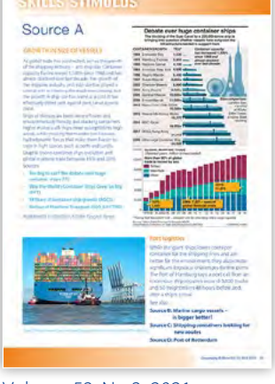
Volume 53, No 3, 2021