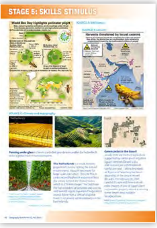
Volume 52, No 2, 2020