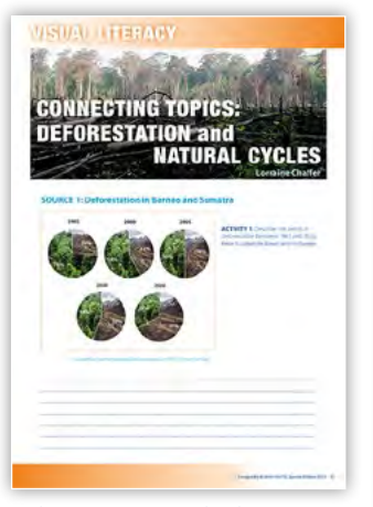
Volume 53, Special Edition 2021