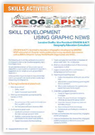
Volume 52, No 1, 2020