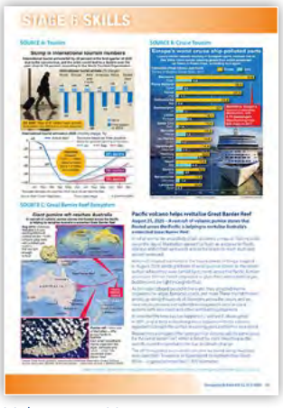
Volume 52, No 3, 2020