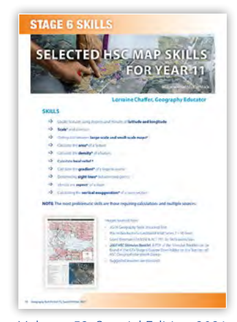
Volume 53, Special Edition 2021

Skills activities are incorporated into most Geography Bulletins. Use the Find a Bulletin Article documents under the Resources Tab on the GTA website to locate activities relevant to the topics you are teaching. Articles are hyperlinked to take you directly to each article after logging in.