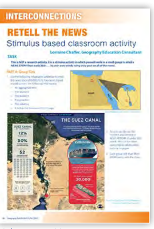
Volume 53, No 2, 2021