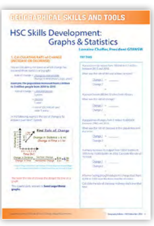
HSC Edition No 1 2018