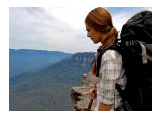
Watch the trailer for Tomorrow When the War Began (2010) https://www.youtube.com/watch?v=9KaX0F8Gojl