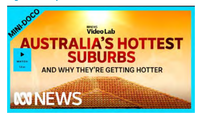
Figure 3: Why Australia's suburbs are so hot