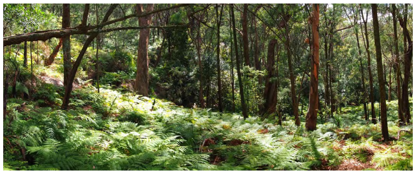
Birrawanna Track.

https://www.facebook.com/HornsbyCouncil/