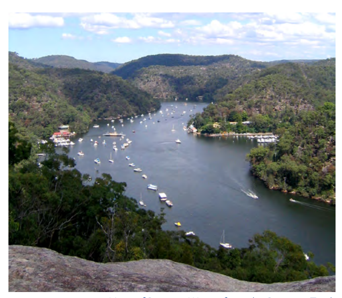
View of Berowra Waters from the Benowie Track.

and safety of footpaths requires an understanding of the natural environment and the human interactions of such environments. Improving travel and access to transport in Hornsby provides an opportunity to understand the processes and the impact on the natural and built environment of private and government transport organisations. In addition the focus on disability is well suited to the section in Stage 5 Human Wellbeing – Human Wellbeing in Australia and the following syllabus item: "... examination of the reasons for and the consequences of differences in human wellbeing for TWO groups of people in Australia.... people with disabilities."